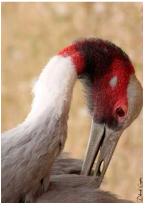
Don't forget to say goodbye and/or come work April 22-23.