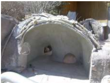
Photo #2 Progress