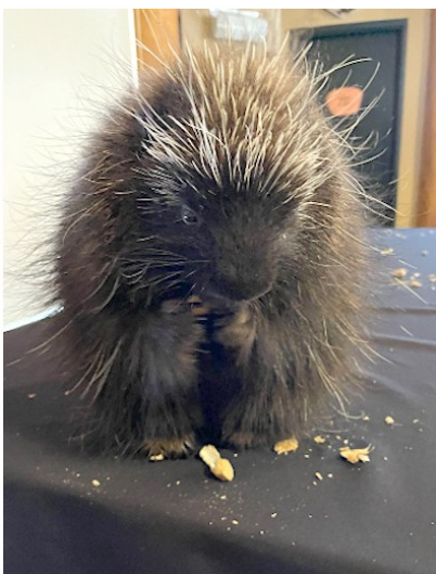
Kale visits Zoo School