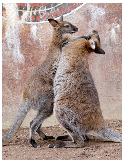
Tim Tam & Clifford wrestling