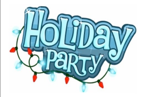
Saturday, December 4<sup>th</sup> 2:00-5:00 P.M.