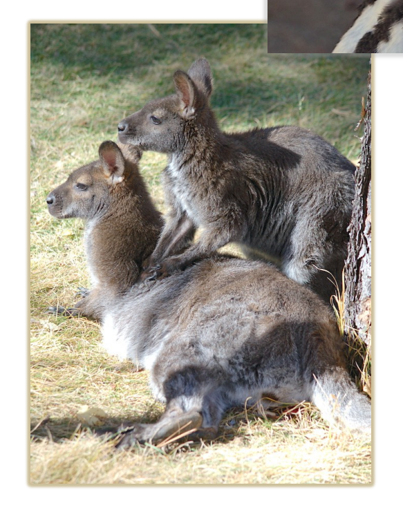
Page 1 picture of Ohe