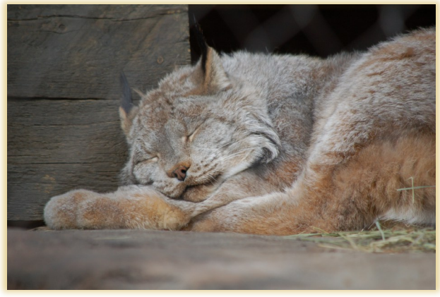
Page 2 – Tapir, Cofan Page 4 – Tim Tam still nursing from Gidgee; Lynx