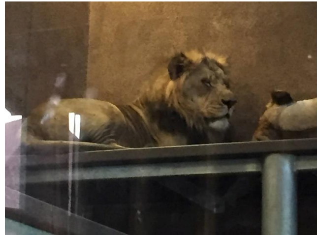
Abuto enjoying Members' Enrichment Night.