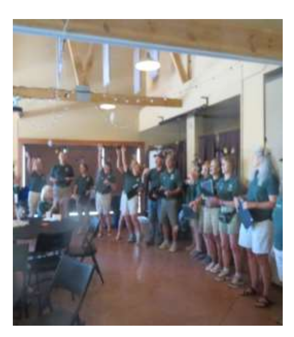
2018 Docent Graduates!