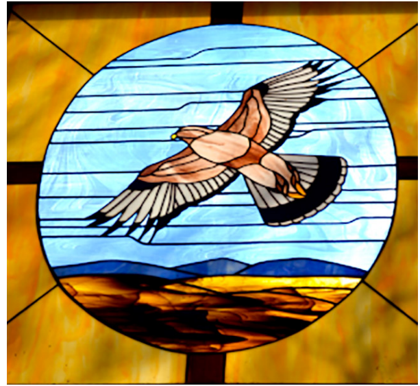
Stained glass window in the Raptor Center building

On April 6, a group of docents visited the Pueblo Raptor Center and the Pueblo Zoo. Caz Oswald submitted these additional pictures she took on that trip.