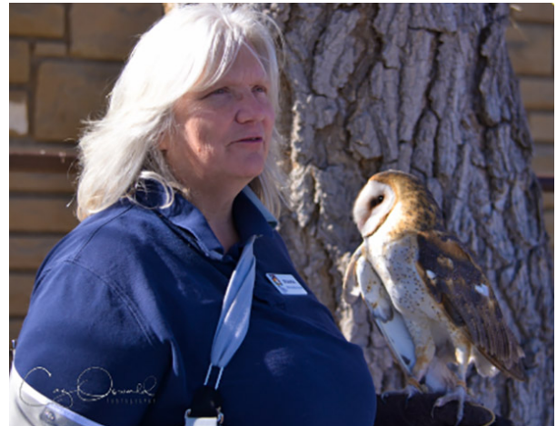
Raptor Center docent with Piper the barn owl