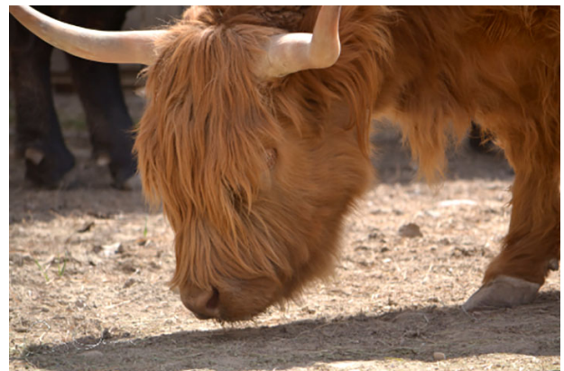
Highland cow at the Pueblo Zoo