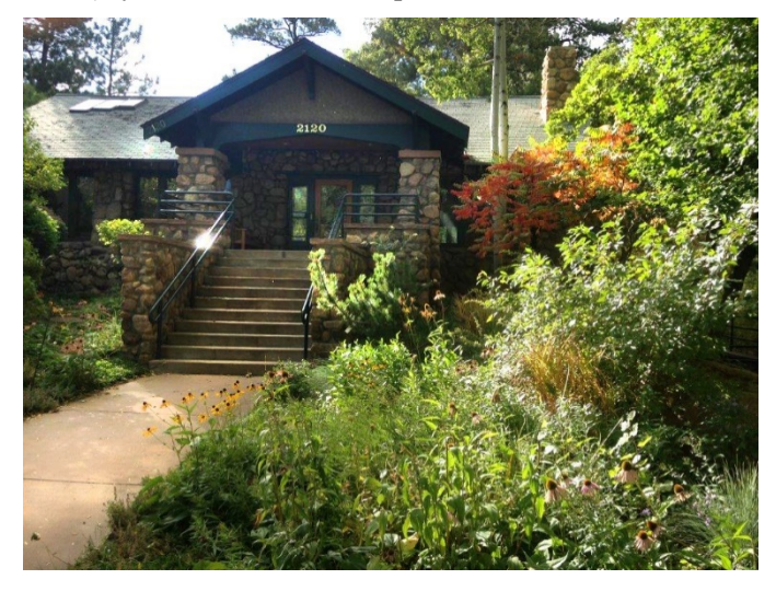
While the Visitor Center is closed at this time, the Lower Columbine Trail starts just beyond the Center and is a gateway into Stratton Open Space on the Chamberlain

Last summer, I attended an evening presentation on birds at Starsmore Visitor and Nature Center (pictured) put on by the Friends of Stratton Open Space. The Starsmore Center is located at the west end of Cheyenne Blvd. where it splits into North and South Cheyenne Cañon Roads. This is very close to the zoo. If you follow Penrose Blvd. to its end when you leave the zoo (instead of turning right onto El Pomar Rd. toward the rear of the Broadmoor Hotel), you will be within a quarter mile of the Center.