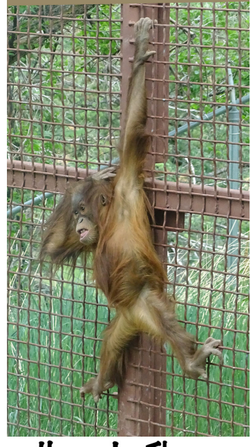
Hang In There