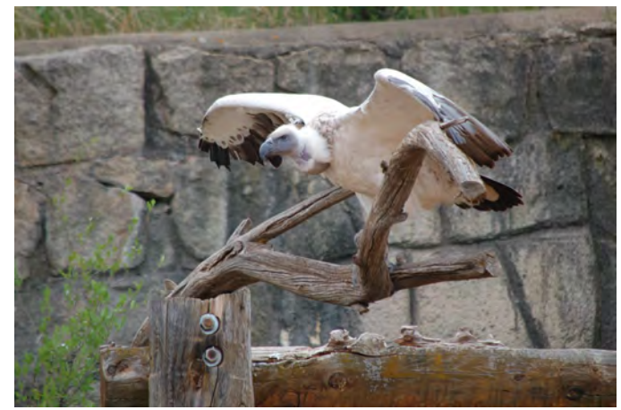
Godric spreading his wings