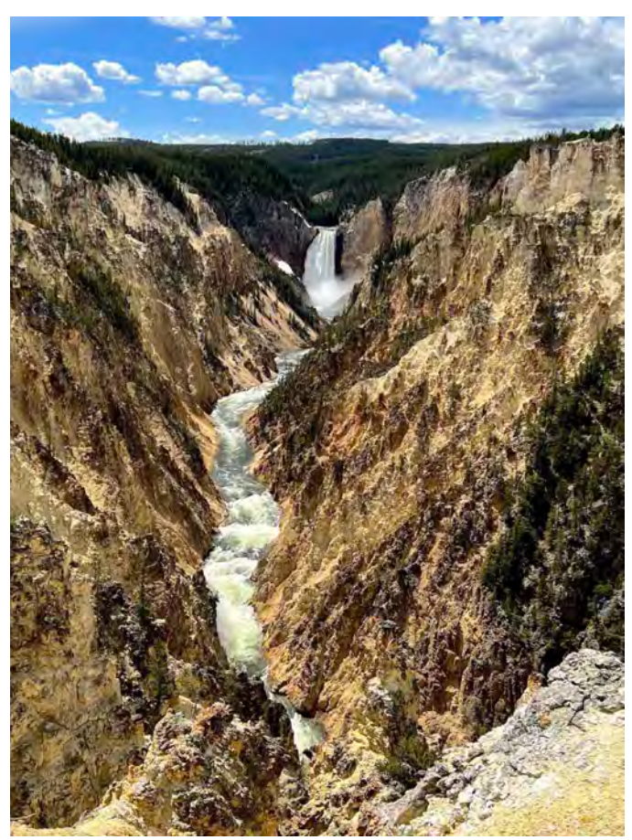
Lower Falls of the Yellowstone River viewed from Artist Point