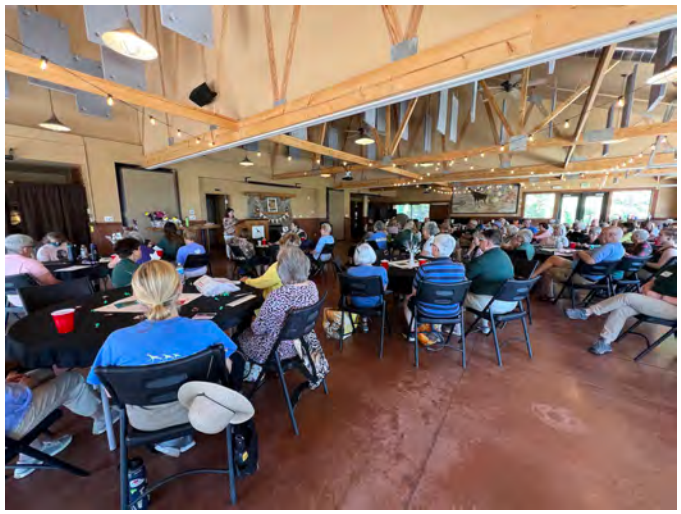
View of the all-docent end-of-year meeting