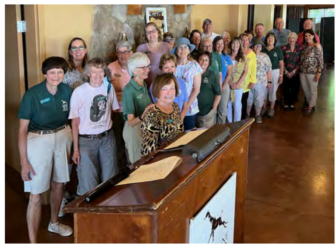
Outgoing CMZ Auxiliary board