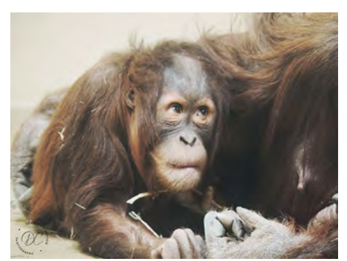
Kera (credit: Deborah Compton)