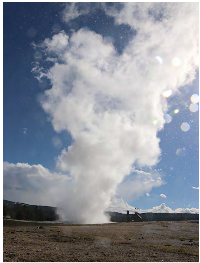
Old Faithful