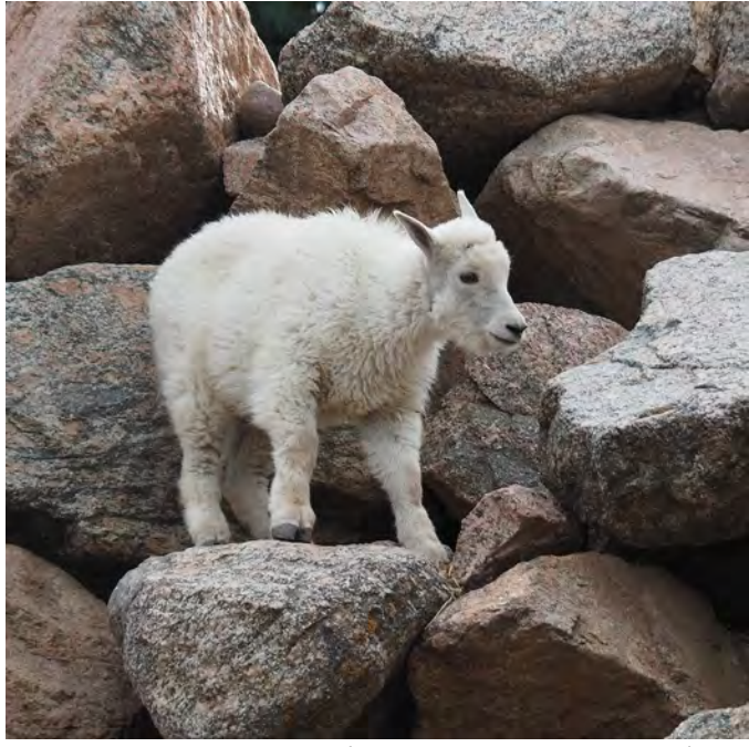
Blanca balancing act