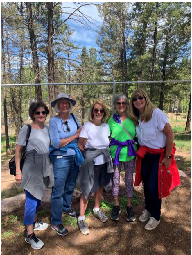
Fun day w/docent friends at the Colorado Wolf & Wildlife Center