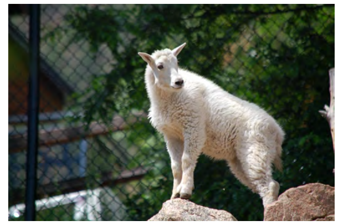
Blanca looking out over her kingdom