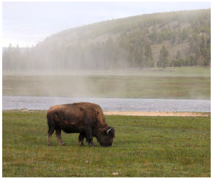
Bison in Fountain Flats area near geyser basins