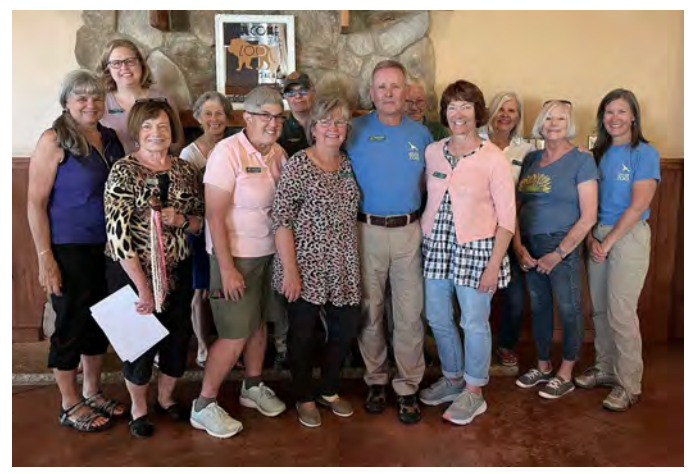
Incoming supplemental activity chairs