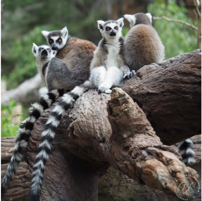
Lemur love