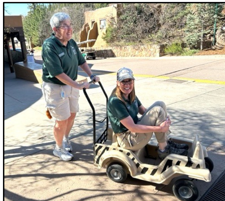
Sometimes tours are really exhausting!

Docents must adhere to the CMZ "Zoo Crisp" standard at any level, including "clean, good quality garments, pressed or wrinkle-free...with shirts tucked in." For further information, see the 2023 Manual, pages Z-10 and Z-11.