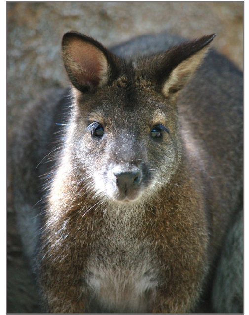
Right – Dobby, new breeding male wallaby in Australia.