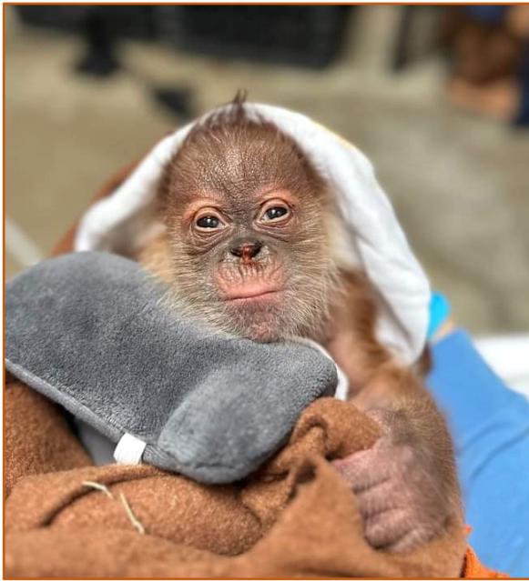
Left - Baby orangutan born May 1 at the Sacramento Zoo. He is the first baby born to Makan and his mate Indah. Makan was born in 2003 at CMZ, the first offspring of Baka and Sumagu, who are now grandparents.