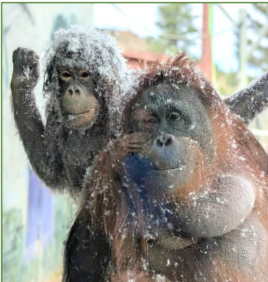
Ember & Hadiah enjoyed a down comforter.