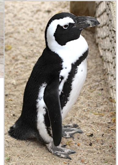
Below - Rock Hyrax taking in the sun in the Colobus enclosure.