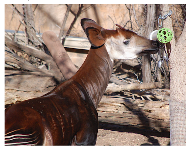
Bahati examining some new enrichment

The balance in the Restricted Account at the end of January remains at $25,039.22.