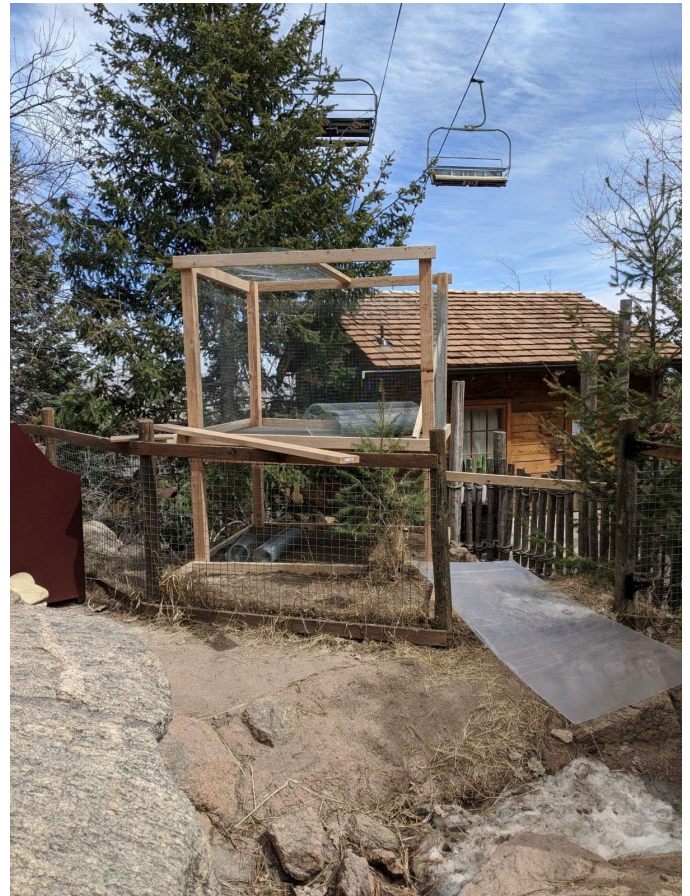
Kevin has been building in BBY during this strange time (above and below).