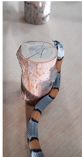
L to R: Hoosier; Kingsnakes Snowman (L) & Zoot (above) use their exercise boards; Great Horned owlets at Colorado Springs School