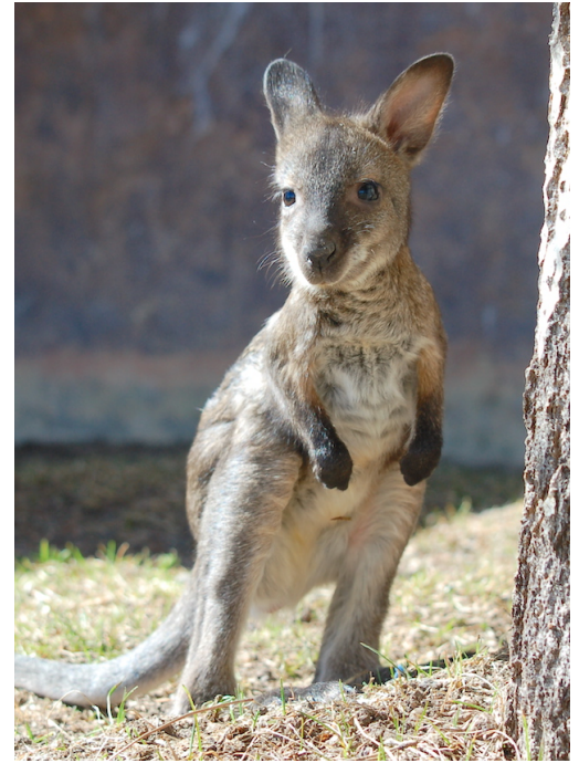
Above: Katt, Matilda's joey Right: Otter snacking