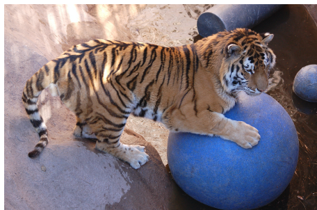
Chewy playing with his ball

The Fall Recall, CEC on Conservation and Spring Fling will remain available until the end of May. Also, a big thank-you to all the docents who prepared the handouts, edited the material and helped with the quizzes. I've enjoyed my job as CEC Chairperson. It's certainly kept me in touch with everyone and has also provided me with an opportunity to continue learning about our animals, conservation and how to work with our guests.