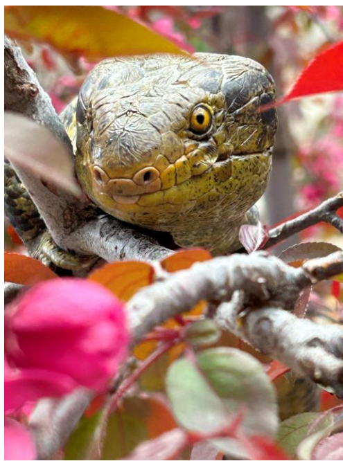
Wasabi the Prehensile-Tailed Skink