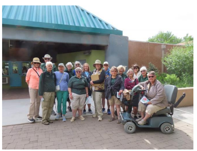
Albuquerque Travelers at the Zoo